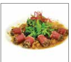
Tuna Sashimi Salad