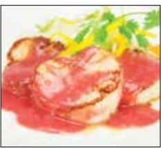
Pan Seared Sea Scallops