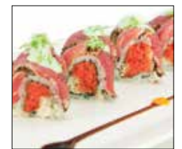
Crazy Tuna Roll