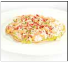
King Crab Pizza