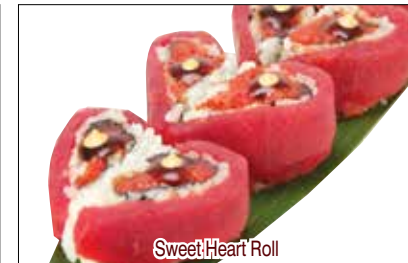
Sweet Heart Roll