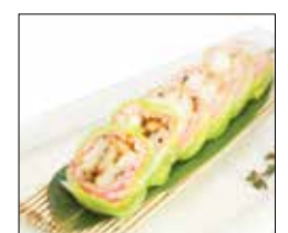
Chilean Seabass Roll