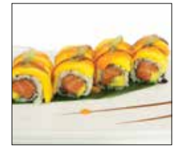
Mango Hawaii Roll