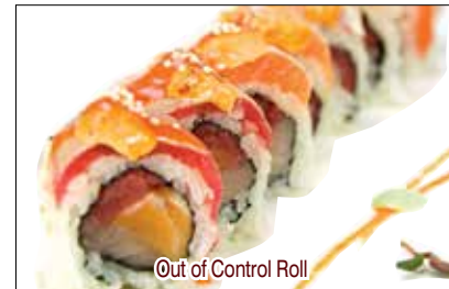
Out of Control Roll