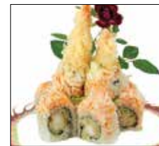
Angry Dragon Roll