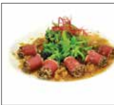
Tuna Sashimi Salad