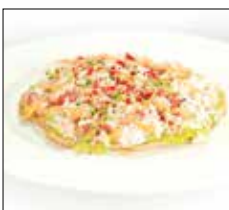
King Crab Pizza