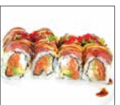
Toro Amazing Roll