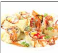
Fire Wok Roll