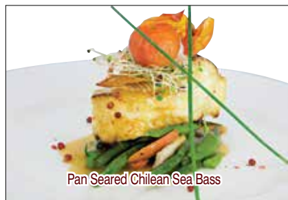
Pan Seared Chilean Sea Bass