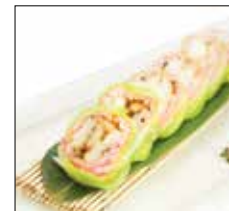
Chilean Seabass Roll