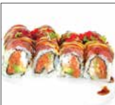
Toro Amazing Roll