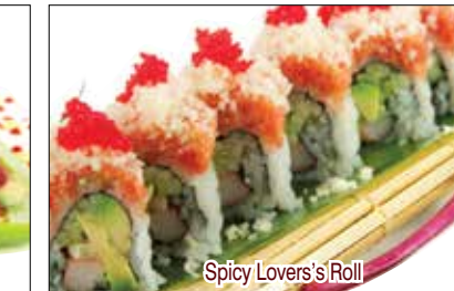
Spicy Lovers's Roll