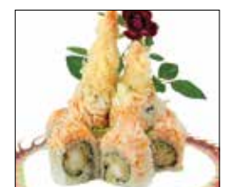
Angry Dragon Roll