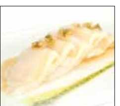
Garlic White Tuna