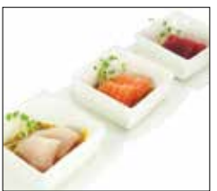
New Style Sashimi