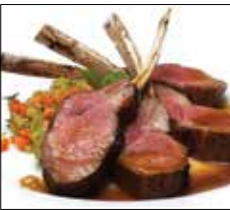
Rack of Lamb