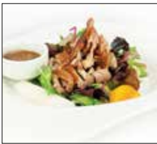
Mandarin Duck Salad