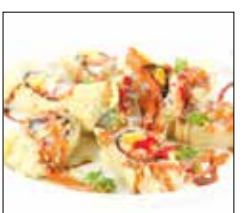
Fire Wok Roll