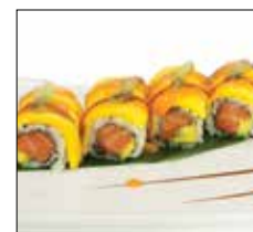
Mango Hawaii Roll