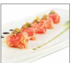
Arctic Char Salmon