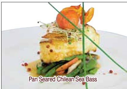
Pan Seared Chilean Sea Bass