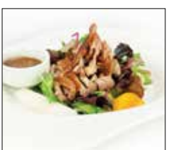
Mandarin Duck Salad