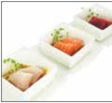
New Style Sashimi