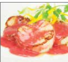
Pan Seared Sea Scallops