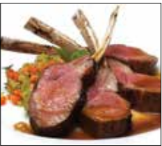
Rack of Lamb