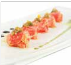
Arctic Char Salmon