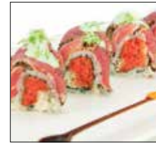
Crazy Tuna Roll