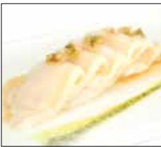
Garlic White Tuna